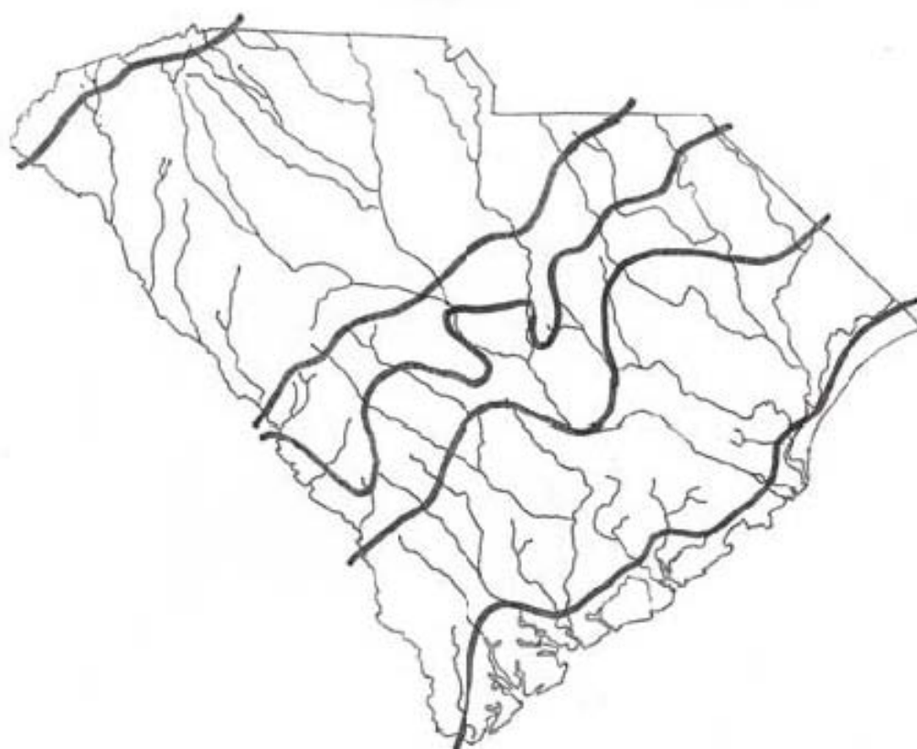
SC 1670 Regions/Rivers